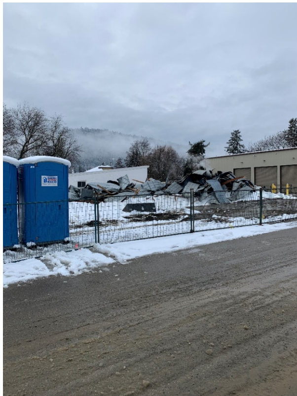
Full demolition of Quonset and sorting of recyclable/reusable materials.