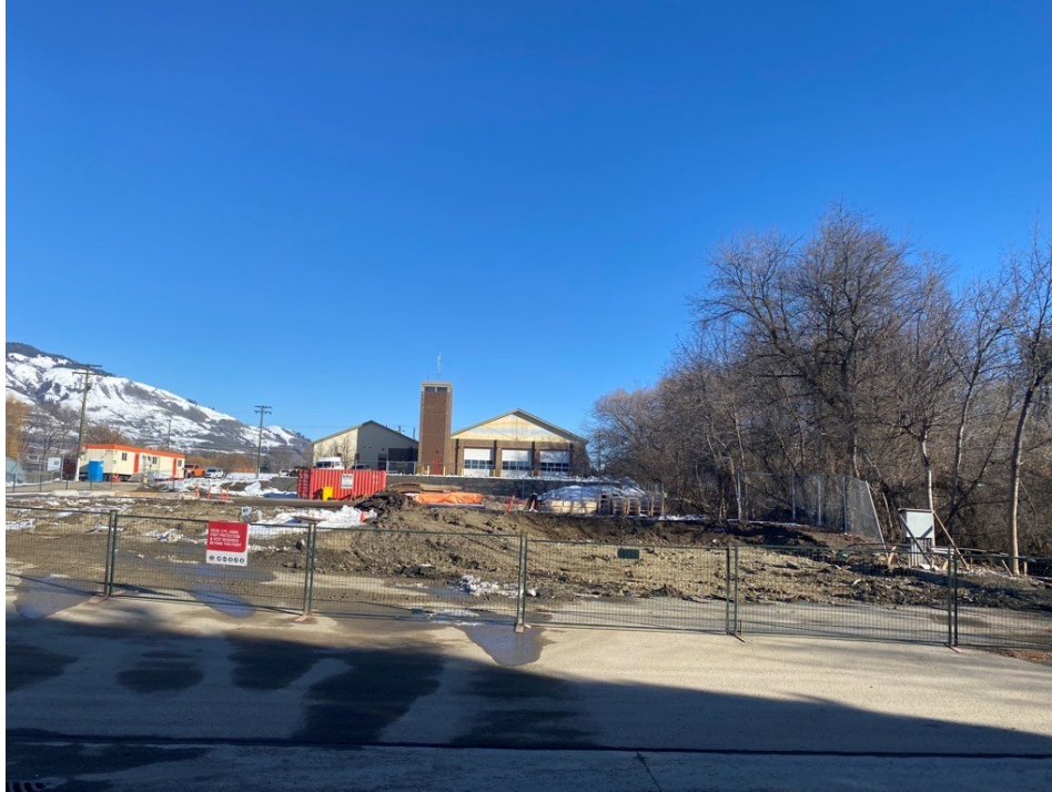
Demolition of all buildings completed.