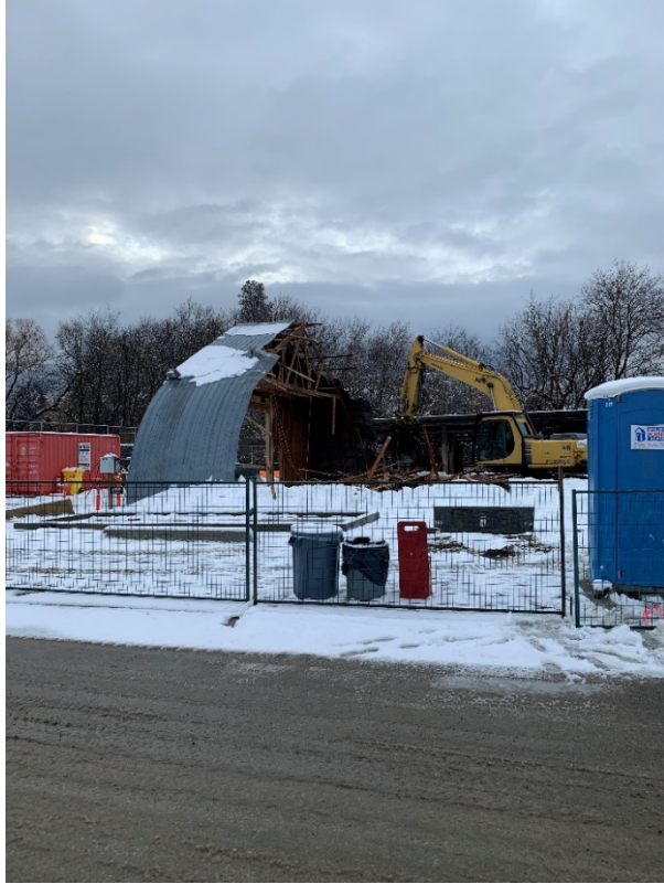
Mid-demolition of the Quonset.