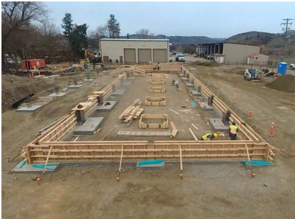
Foundation wall forms.