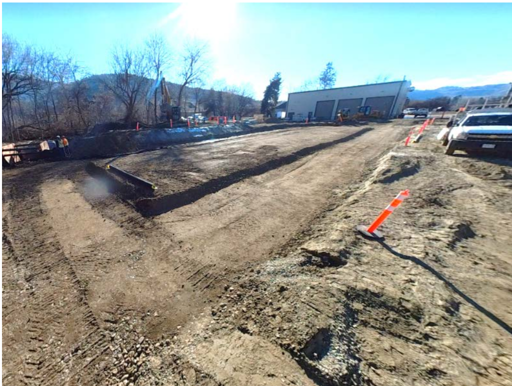
Installation of site services (storm).