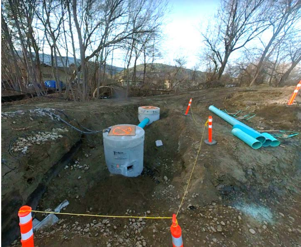
Ground prepared for footings.